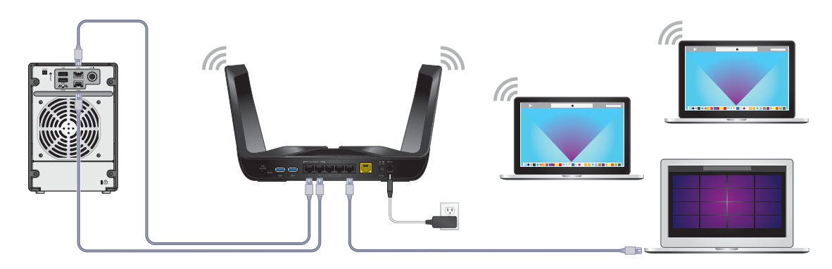
Figure 5. Ethernet port aggregation