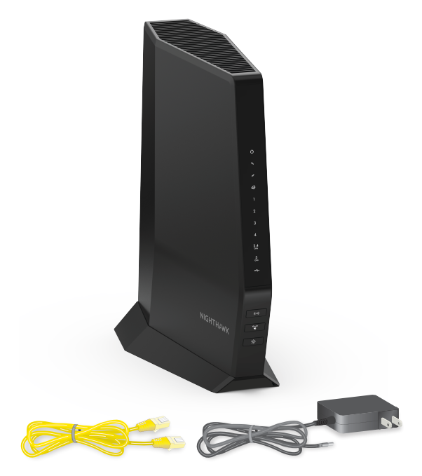
Figure 1. Package contents

Your package contains the modem router, Ethernet cable, and power adapter.