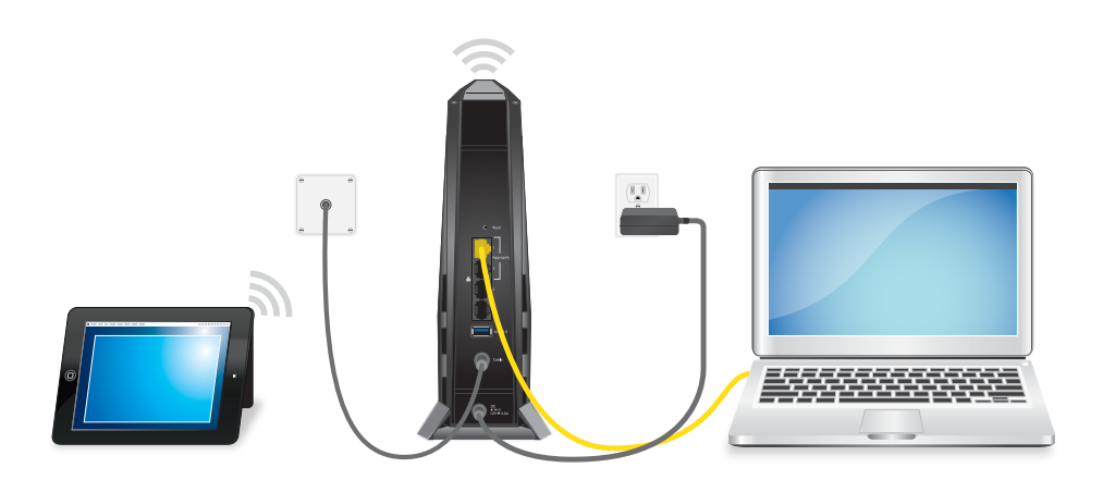
Figure 4. Connect the modem router directly to a computer

Note: Before you connect your modem router and contact your cable Internet provider, collect your cable account number, account phone number, and login information (your email address or user name and password).