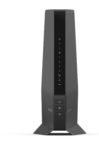
Figure 2. Modem router LEDs and buttons

You can use the LEDs to verify status and connections. The following table lists and describes each LED on the top panel of the modem router.