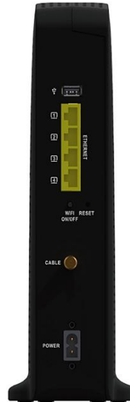
Figure 2. Cisco Residential Wireless Gateway Model DPC3848 Back Panel