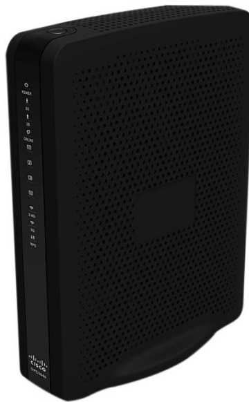
Figure 1. Cisco Residential Wireless Gateway Model DPC3848

This Cisco integrated router features a Dynamic Host Configuration Protocol (DHCP) server, Network Address Translation (NAT) and Network Address and Port Translation (NAPT), and a Stateful Packet Inspection (SPI) firewall. These features provide a single high speed public Internet connection and allow users to share files and folders between devices in the home network by attaching multiple wired and wireless devices in the active home or office to the wireless residential gateway.