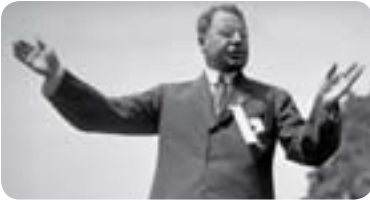
James M. Cox is seen here as Ohio's first three-term governor campaigning for the 1920 Democratic candidacy for President.