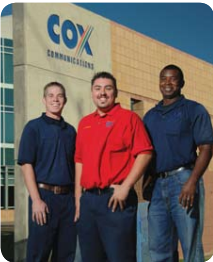
Cox Arizona field technicians deliver local customer service to Cox subscribers statewide.

Cox has a history of recognition for advocating diversity in its workforce.