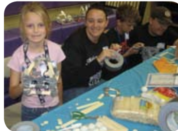
Cox Connects Day 2007: Cox Arizona employees volunteer with activities at the Boys and Girls Clubs of Scottsdale.

For example, "Cox Connects Day" is a day each year when Cox employees give back to a local Boys & Girls Clubs. Cox Arizona has a history of supporting local Boys & Girls Clubs and this day of volunteerism is a great extension of our partnership.