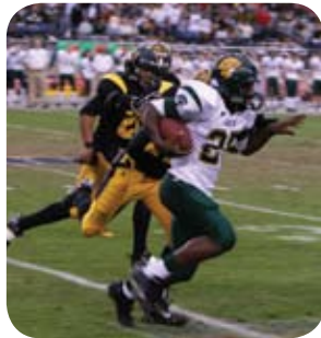
Cox7 - AZ provided live coverage of the 2007 High School Football Division Championships.

High school football – The Cox7 sports team brings Cox customers the very best in high school athletics. For more than 25 years, Cox Arizona has been exclusively broadcasting Arizona Interscholastic Association (AIA) high school football games live on Cox7 statewide. High school football programming includes: ‘Game of the Week,’ weekly playoffs and the football championships. To learn more about high school football on Cox7 please visit the high school football Web page . In addition to high school football, Cox7 brings viewers AIA volleyball, softball and baseball.