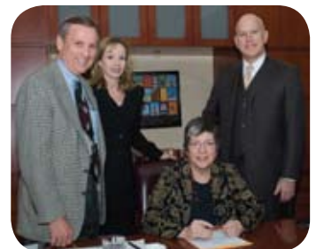
Arizona Gov. Janet Napolitano signs Cable Customer Tax Relief Act, 2006.

2008 Cox Arizona launches On DEMAND in the city of Scottsdale, with rollout continuing statewide in Cox markets throughout the year